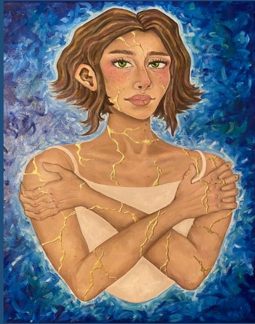
“KINTSUGI SELF PORTRAIT” OIL PAINT